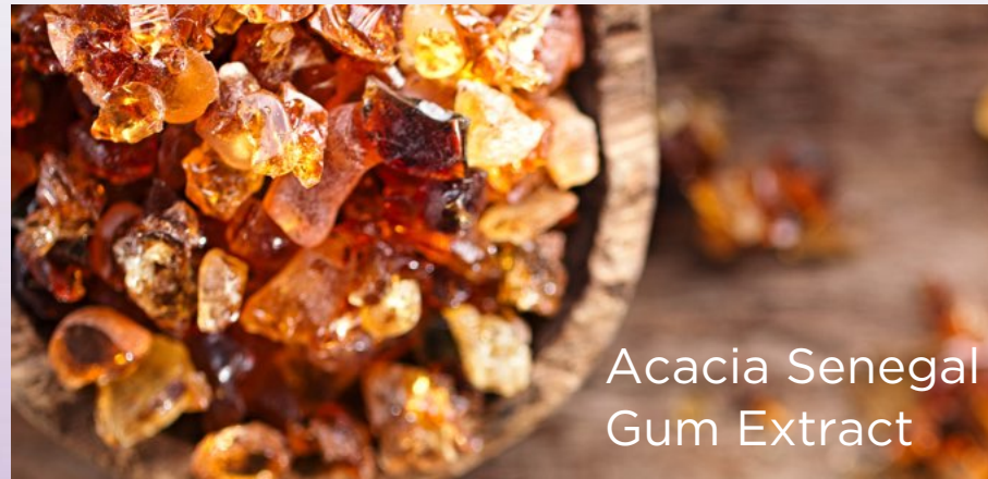
Acacia Senegal Gum Extract